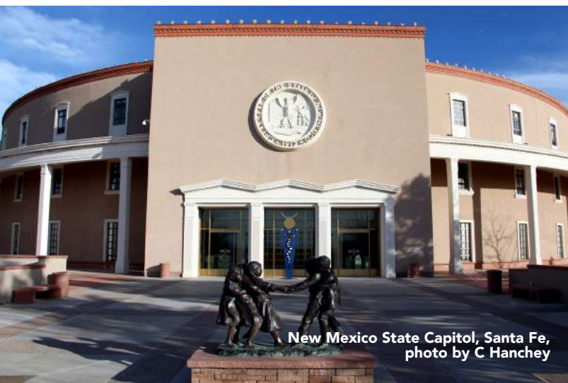
New Mexico State Capitol, Santa Fe

After breakfast, depart the hotel and join an included group transfer to the Albuquerque Airport. Otherwise, depart independently at your leisure. B