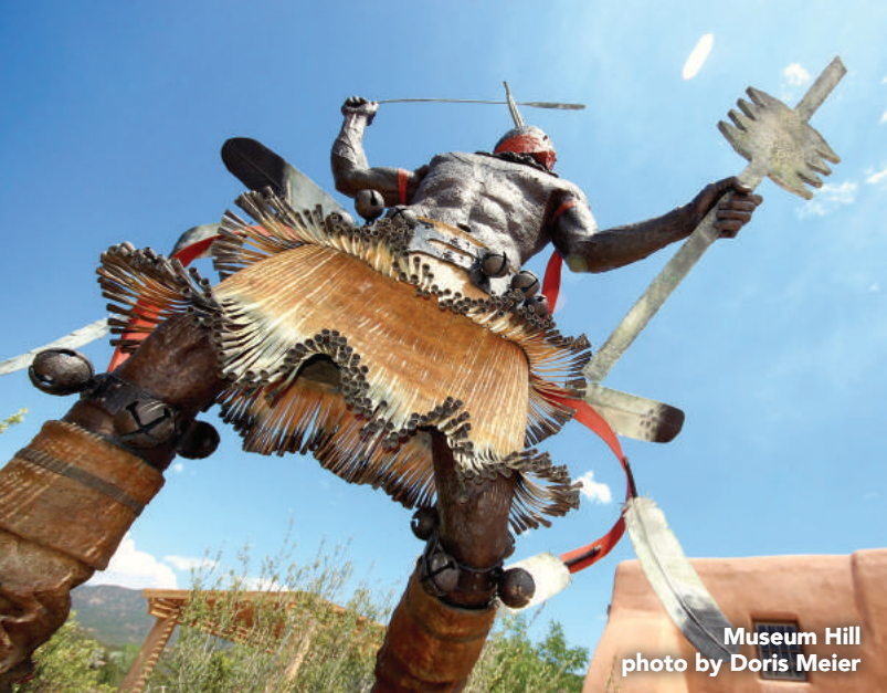
Museum Hill