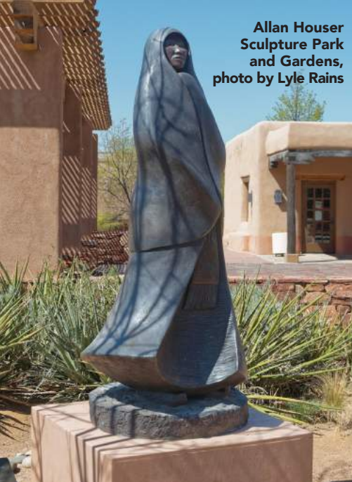
Allan Houser Sculpture Park and Gardens