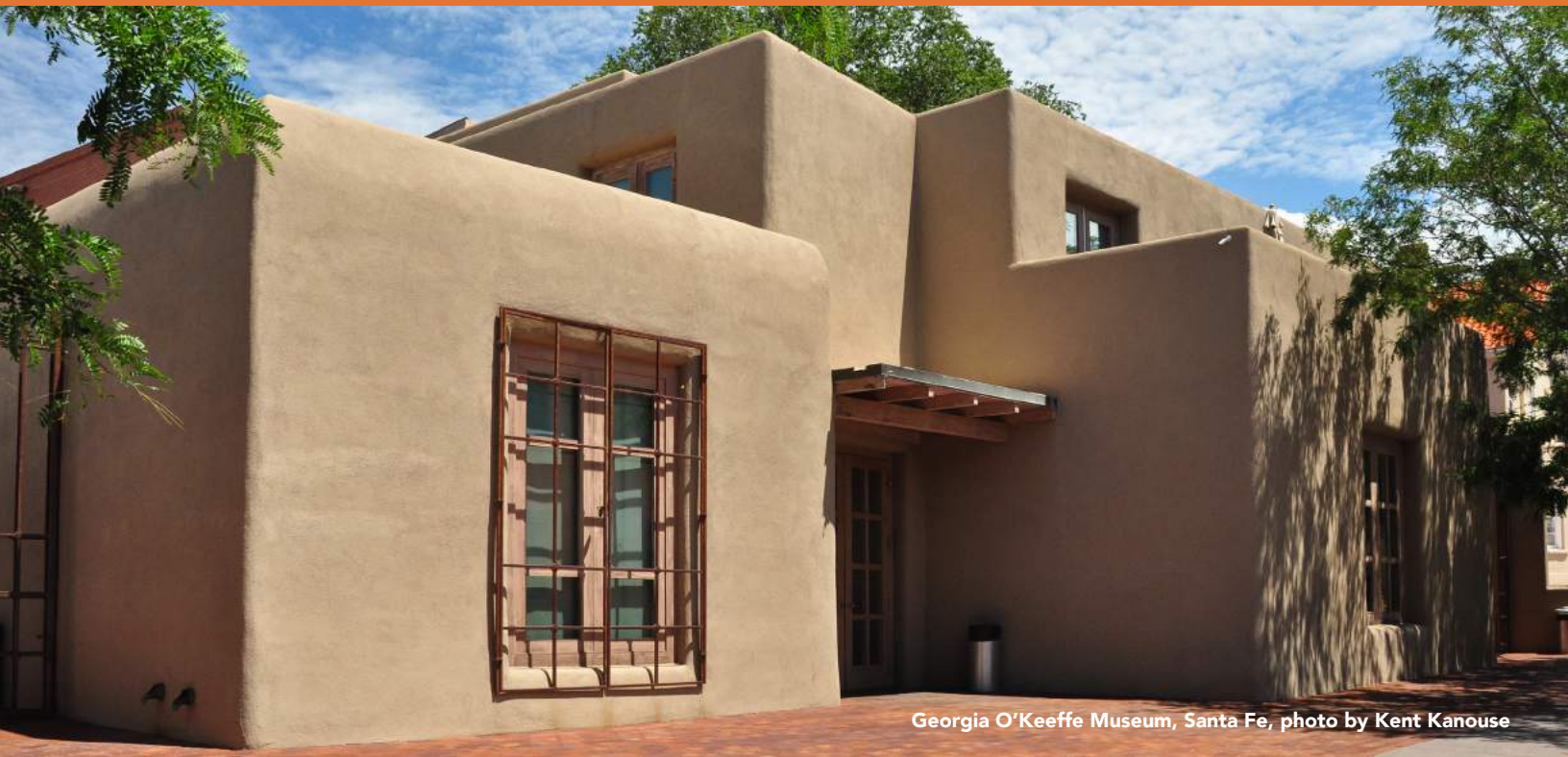
Georgia O'Keeffe Museum, Santa Fe