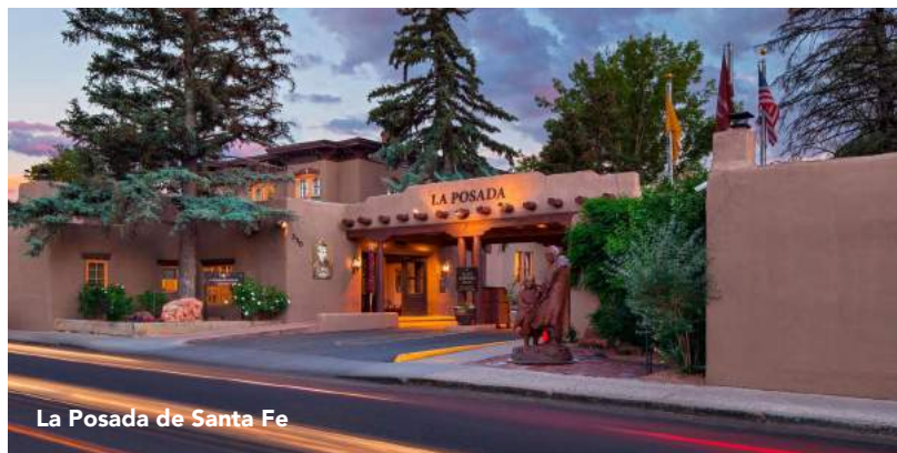
Lobby, La Posada de Santa Fe

The only resort in downtown Santa Fe, this Southwestern-style hotel offers easy access to the historic Plaza and Canyon Road, the magical half-mile of art galleries. Follow open pathways to your upscale guest room, completely unique with plush bedding and options like cozy fireplaces, private patios, and scenic garden views.