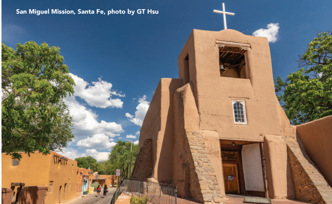
San Miguel Mission, Santa Fe