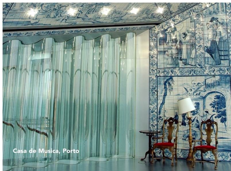
Casa da Musica, Porto

DISCLAIMER: This itinerary is subject to change at the discretion of Museum Travel Alliance. For complete details, please carefully read the terms and conditions at https://museumtravelalliance.com/faq.php .