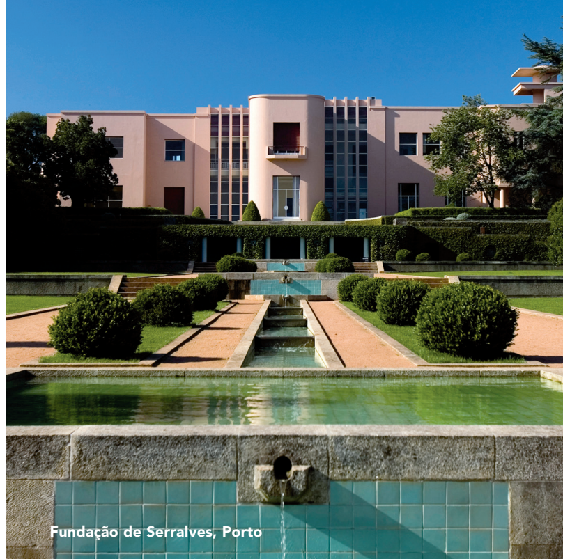
Fundação de Serralves, Porto