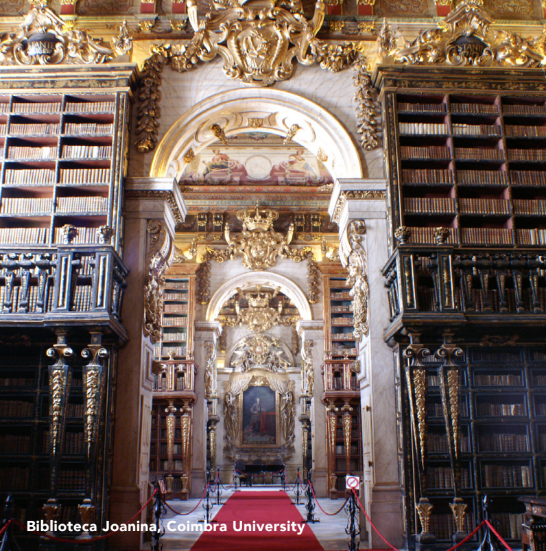
Biblioteca Joanina, Coimbra University