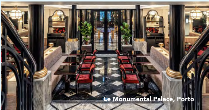
Le Monumental Palace, Porto

Located on the Praça do Comércio near the Tagus River, the Pousada de Lisboa is housed within a stately building that once was home to the Ministry of Internal Affairs. Enjoy generously sized, elegantly decorated rooms; a spa; swimming pool; sauna; treatment room; fitness center; two bars; and an à la carte restaurant.