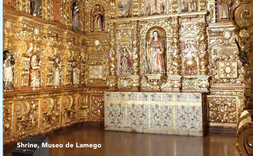
Shrine, Museo de Lamego

NOT INCLUDED IN RATES International airfare; passport/visa fees; personal items and expenses; airport transfers for those not on suggested group flights; baggage in excess of one suitcase; trip insurance; any other items not specifically mentioned as included.