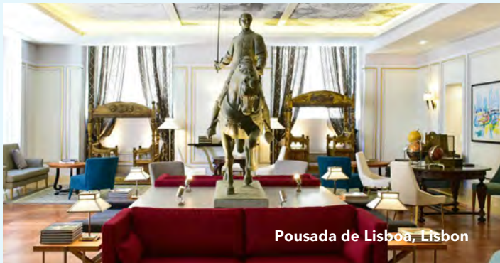
Pousada de Lisboa, Lisbon