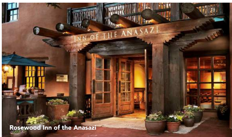
Rosewood Inn of the Anasazi

Located steps from the city's historic Plaza, this luxurious boutique hotel blends Southwestern style with five-star service. The 58 rooms and suites have flat-screen televisions, Wi-Fi, and fireplaces. The inn's elegant décor features local textiles and paintings. Amenities at the hotel include a restaurant that serves cuisine inspired by Santa Fe's culture, a bar and lounge, and a fitness center.