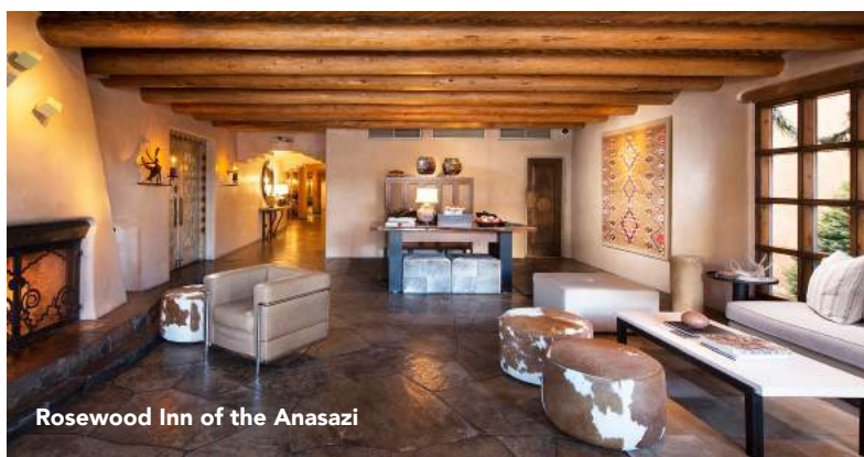
Rosewood Inn of the Anasazi