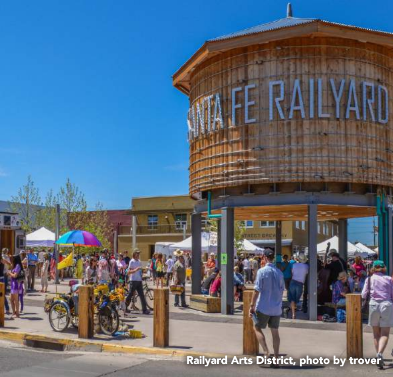
Railyard Arts District