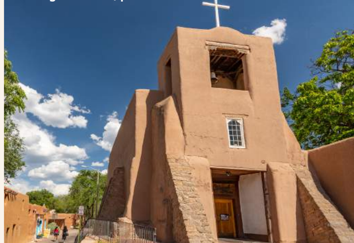
San Miguel Mission

If you book this program by March 1, 2021, your reservation deposit will be fully refundable until 60 days before departure.