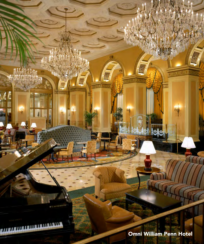
Omni William Penn Hotel