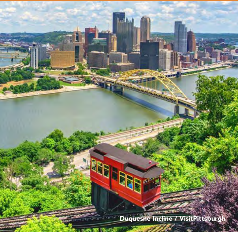
Duquesne Incline