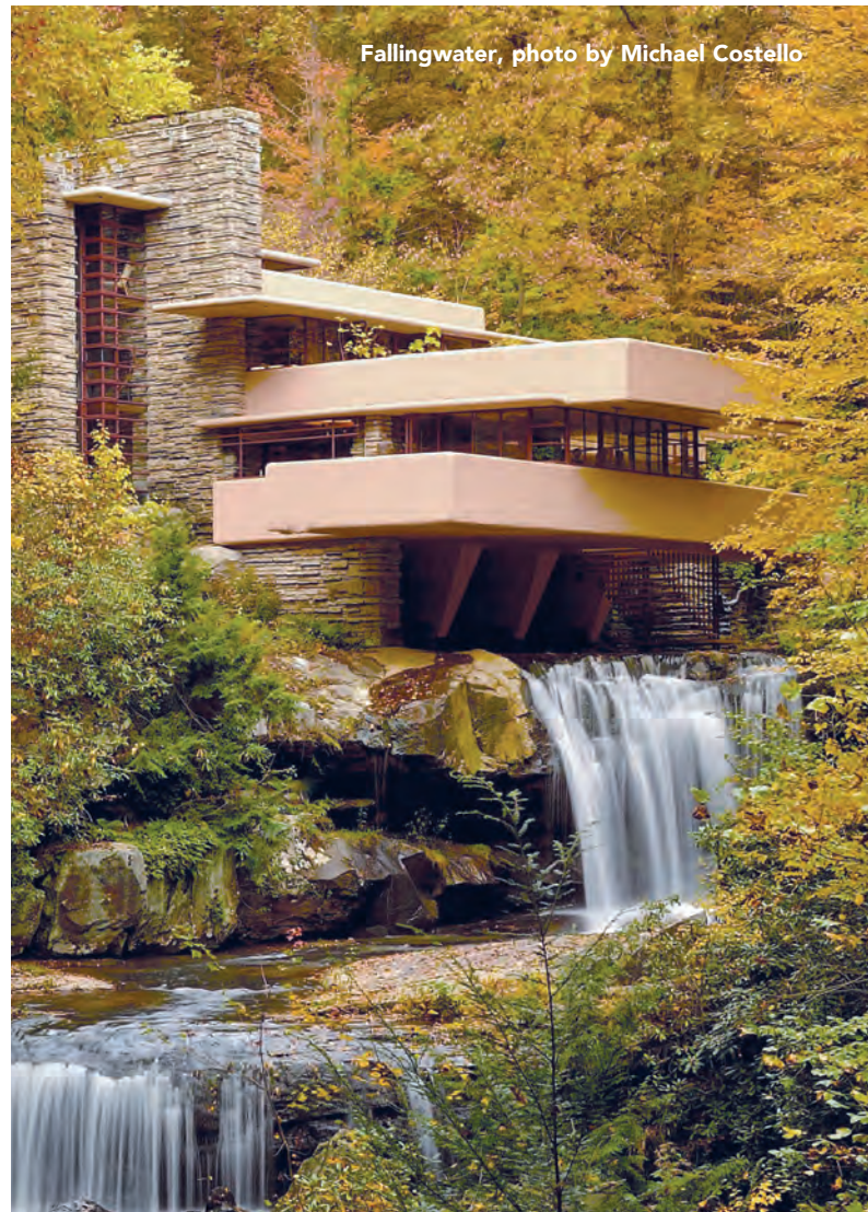
Fallingwater